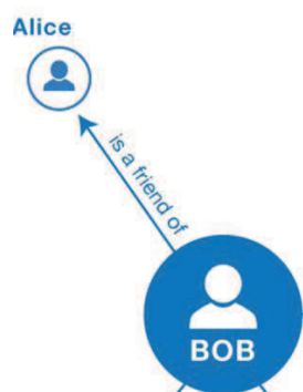
Figure 1: Part of Informal graph of the sample triples.

Here is an example: <Bob> <is a friend of> <Alice>. It can be expressed in a graph as seen in Figure 1.